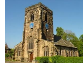
St Mary's Church- Derby