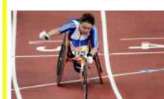
Baroness Tanni Grey-Thompson

Did you know?: Laura is married to another Olympian who also happens to be a gold medal-winning track cyclist called Jason Kenny.