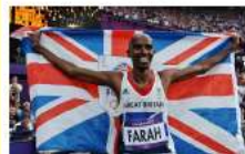
Sir Mo Farah