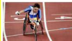
Baroness Tanni Grey-Thompson

Did you know?: Laura is married to another Olympian who also happens to be a gold medal-winning track cyclist called Jason Kenny.