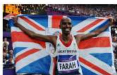
Sir Mo Farah